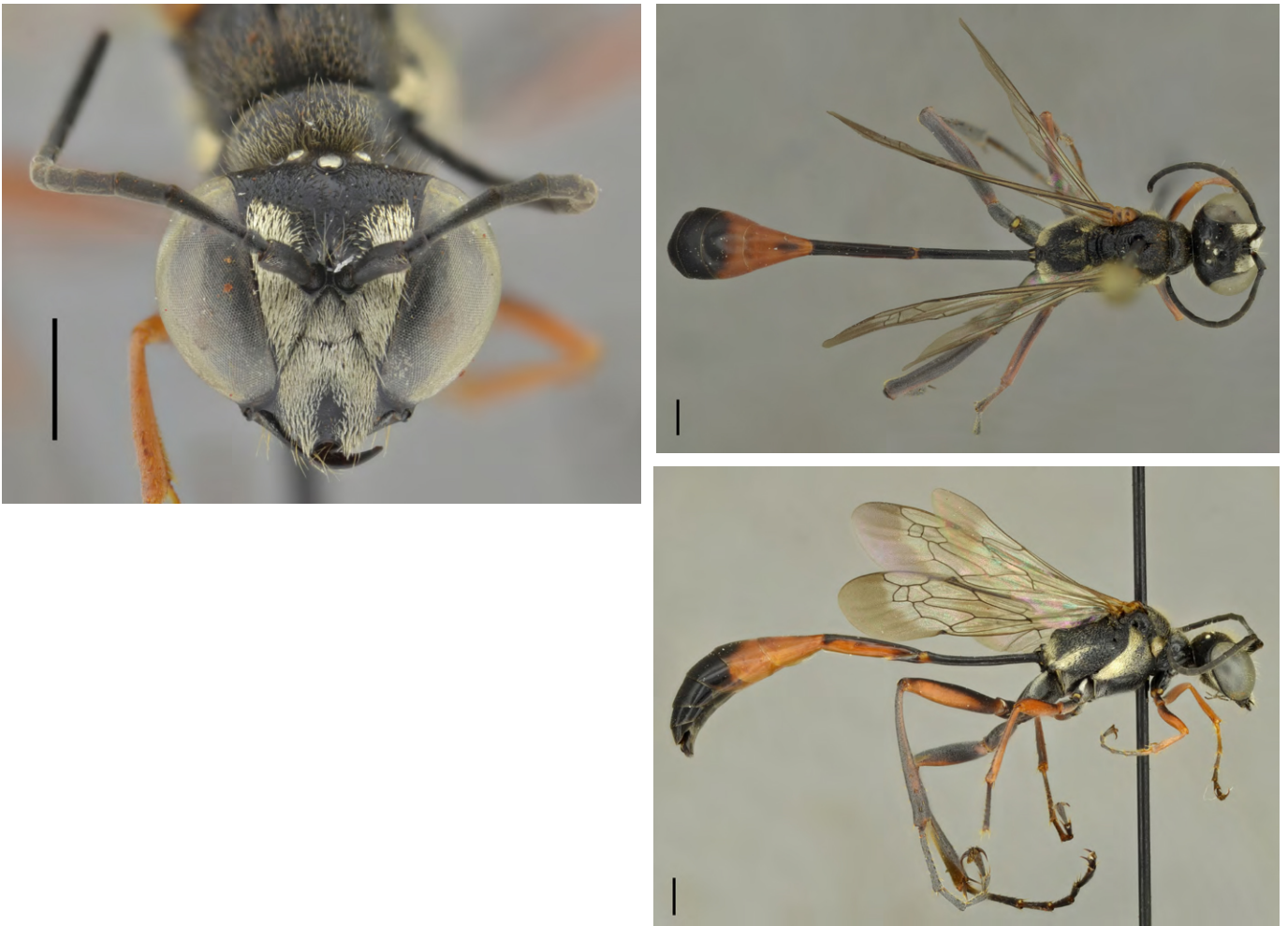
Figures 5–7. Ammophila hevans Menke, 2004 ♂ (Brazil: Mato Grosso Sul, Dourados, 21°59'37" S, 055°19'25" W; 429 m, 06.ii.2014, B.M. Trad col., Hym-00020-S). 5. Frontal view. 6. Dorsal view. 7. Lateral habitus.