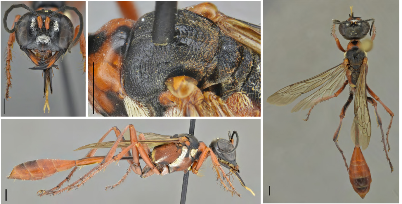
Figures 1–4. Ammophila hevans Menke, 2004 ♀ (Brazil: Mato Grosso Sul, Dourados, 21°59'37" S, 055°19'25" W; 429 m, 23.v.2015, F.V.O. Lima et al col., Hym-00611-S) 1. Frontal view. 2. Scutum. 3. Lateral habitus. 4. Dorsal view. Scale bars = 1 mm.